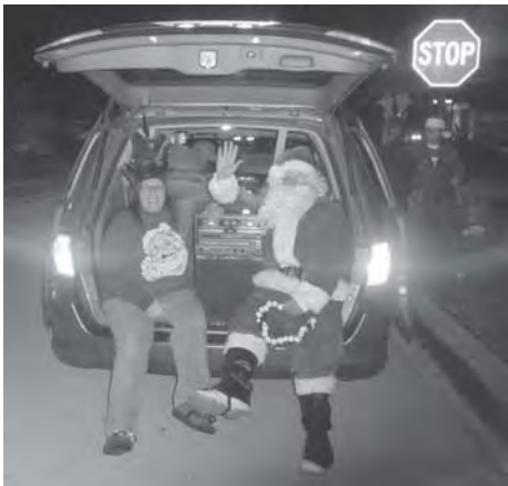
Pictured here with Santa is our very own Social Committee and Board Member