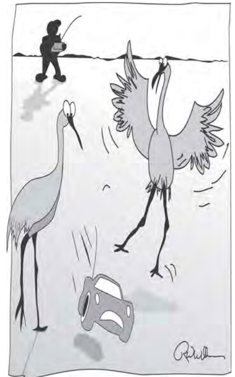
Speed Weeks at The Sanctuary

We sold 40 homes in 2010; 20 were traditional sales while 8 were short sales and 12 bank owned. That is compared with 2009 selling 48 homes with 26 traditional sales, 10 bank owned, and 12 short sales. Looks like we are getting a lot of the short sales and bank owned homes sold off, but it is hurting the values of our homes. Currently we have 17 active listings in the Sanctuary with 7 traditional homes, 2 bank owned and 8 short sales. I'm hoping for a brighter 2011 and will keep you posted each quarter. Please feel free to call me any time if you have any real estate questions. I can be reached at 407-587-9326. ❀